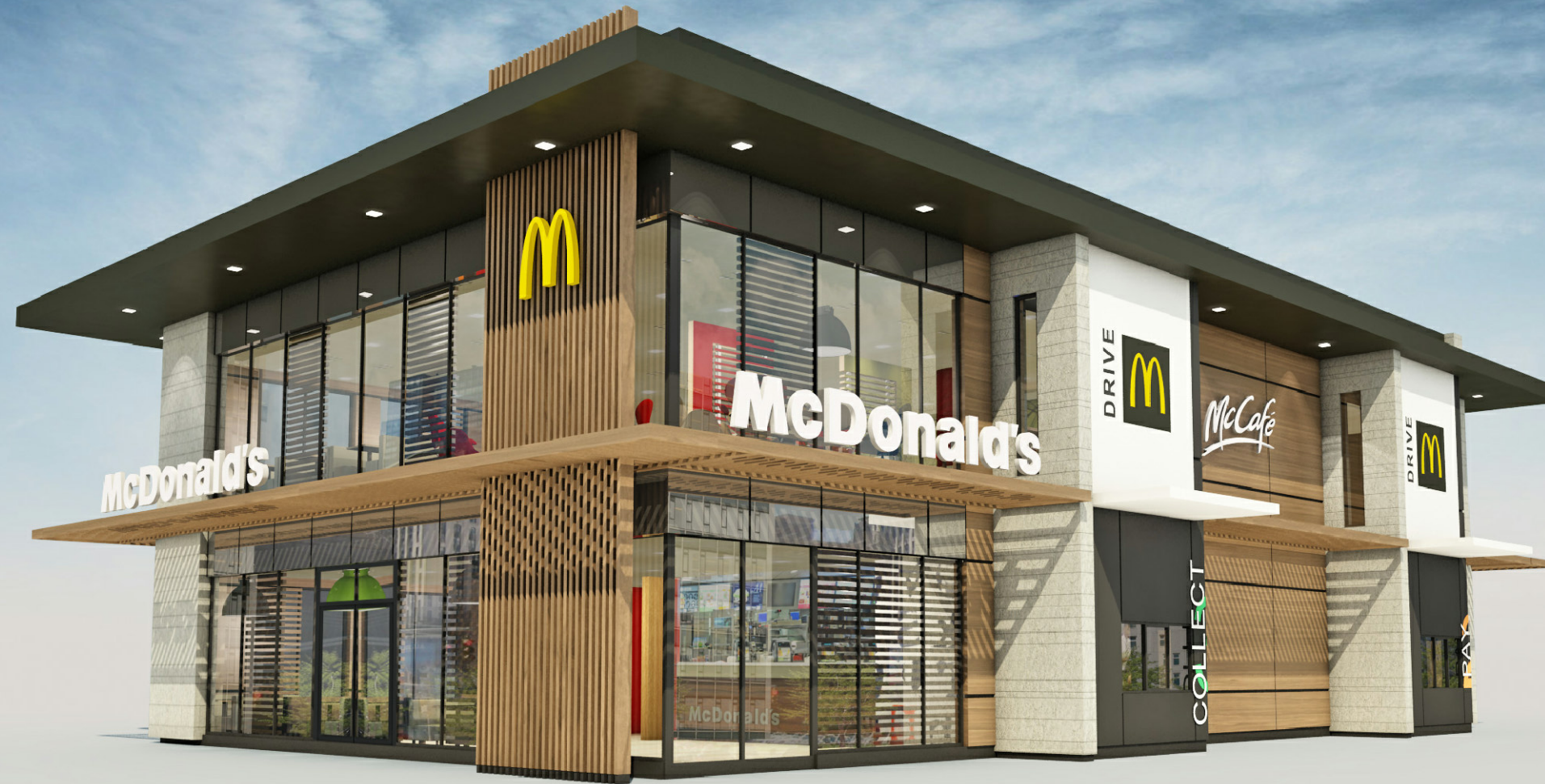
REFERENCE IMAGE 08.1